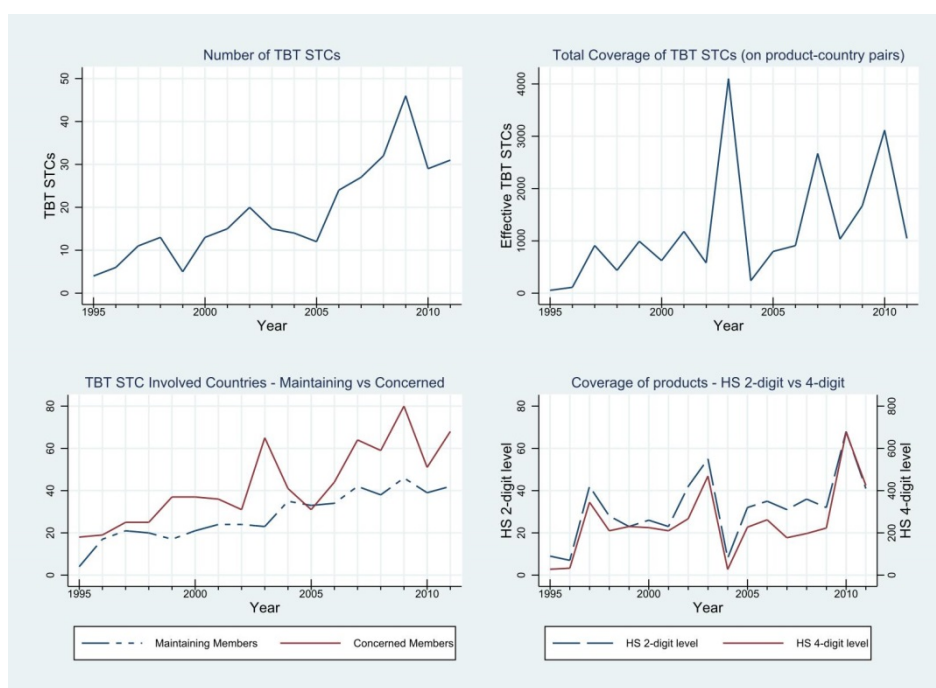
Figure 1 / Trend of TBT STCs and their coverage

Figure 1 shows the trend of TBT STCs over the period 1995-2011. It is observed that the number of these TBT STCs was gradually increasing over time (see upper left panel). Especially during the 2007-2008 crisis, there was a sharp rise in these notifications. According to the World Trade Report (2012) the usage of NTM instruments has increased during the recent financial crisis to adjust to market inefficiencies and in order to assist countries in finding a way out of the crisis. Each TBT STC involves various groups of products. The product coverage (at 2-digit HS on the left vertical axis, and at 4-digit level on the right axis) of all TBT STCs during this period is shown in the lower right panel. The majority of TBT STCs are raised by many different countries facing the new regulations, which increases the total effective coverage of these NTMs.