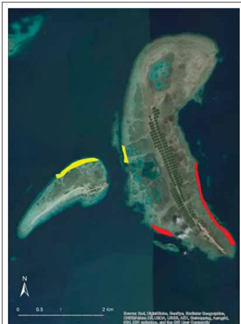
Mined areas of Ubay (yellow) and Batasan (red). Mapped by mounting a Global Positioning System (GPS) device with tracking function onto a motorized boat. The operator, a key informant (the chairperson of the Marine Protected Area Management Council of Batasan, who was born and raised in Ubay), then drove along the perimeter of the mined areas (map generated by Ma. Laurice Jamero using ArcGIS).

In the existing literature, cost analysis has often been used as a means to understand a community's ability to adapt by comparing its financial resources with costs entailed by implementing various adaptation strategies (Nicholls and Tol 2006). In most cases, these studies find that small island developing states may be unable to afford engineering methods that tend to be very expensive (Yamamoto and Esteban 2014), hence rendering them vulnerable to climate change. However, as a glaring counterexample, the island communities of Tubigon have so far been able to adapt to tidal flooding despite their poverty and their use of basic technology (e.g., using local tidal information to determine the need for evacuation) or even traditional knowledge (e.g., building stilted houses, taller furniture). Thus, financial cost may not be enough to define the limits of adaptation, although the analysis of nonmonetary costs, such as social and cultural, may prove more meaningful.