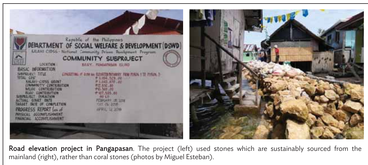
Road elevation project in Pangapasan. The project (left) used stones which are sustainably sourced from the mainland (right), rather than coral stones.