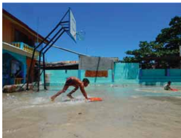
Bilangbilangan school grounds. During peak tides of +2.0 meters in June 2016 (left) and in June 2018 (right).

In response to the worsening environmental conditions, the island communities of Tubigon and various supporting groups are reinforcing existing adaptation strategies, while exploring new ones. For example, a new project involving road elevation in Ubay island has ensured that new elevated roads are significantly higher than older ones, which were constructed and elevated immediately after the 2013 earthquake, to accommodate the increase in flood height. The Municipal Government of Tubigon has also become more proactive in helping the island communities properly implement in situ adaptation, such as by securing national funding for road elevation projects in the islands and by promoting the use of stones that have been sustainably sourced from the mainland in these projects in order to curb the impact of coral mining in the area (see picture on the right on page 5). Further, the municipal government has moved away from its initial traditional approach to relocation, which aims to move all residents of the islands into permanent houses in the mainland. Currently, the municipal government is promoting the use of education as a means to naturally depopulate the islands, by teaching school children skills and expertise that are employable in the mainland.