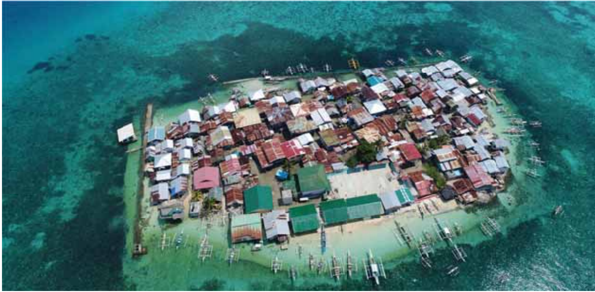
Aerial view of Bilangbilangan island. Bilangbilangan becomes partially or completely inundated during normal spring tides, depending on local weather conditions.