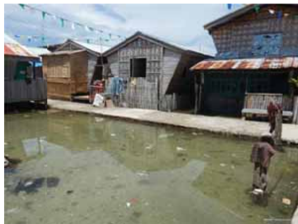
Tidal flooding and adaptation. Roads (right) and floors of important community services such as chapels (left) have been elevated in the islands of Tubigon.