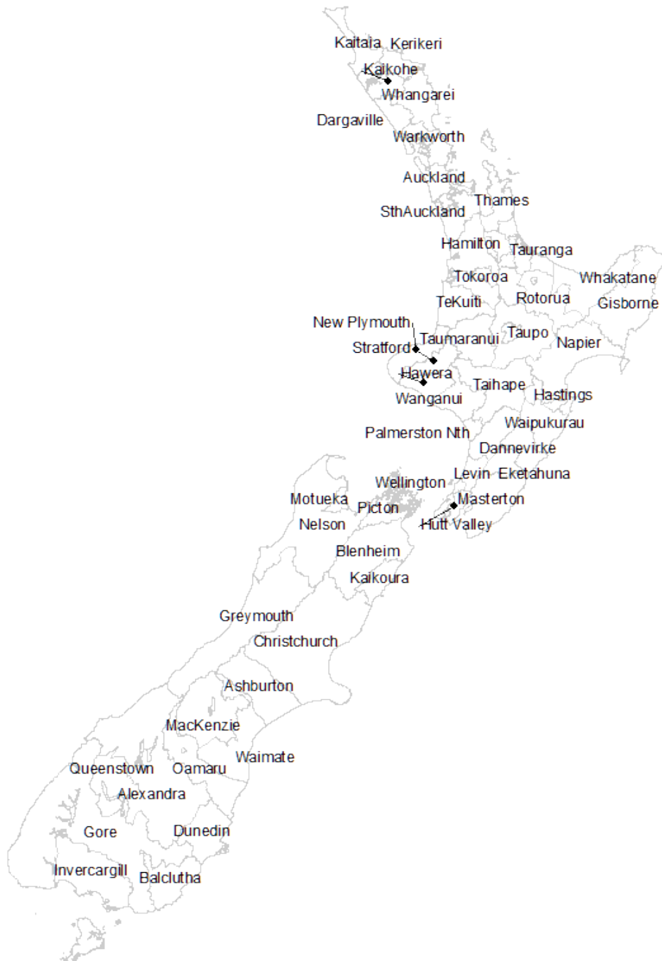
Figure 3. New Zealand Labour Market Areas