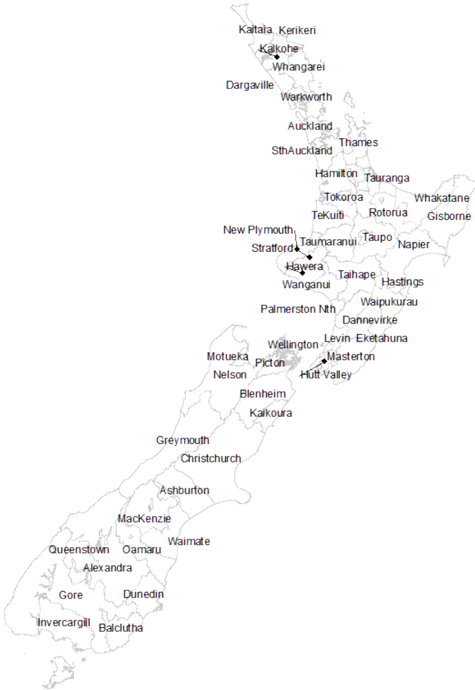
Figure 3. New Zealand Labour Market Areas