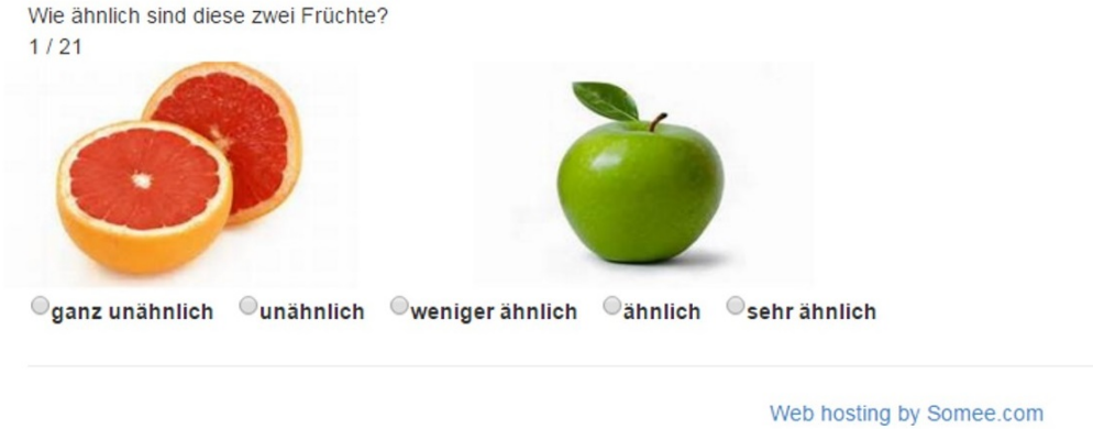
Figure 2: A screenshot of part 2 of the study