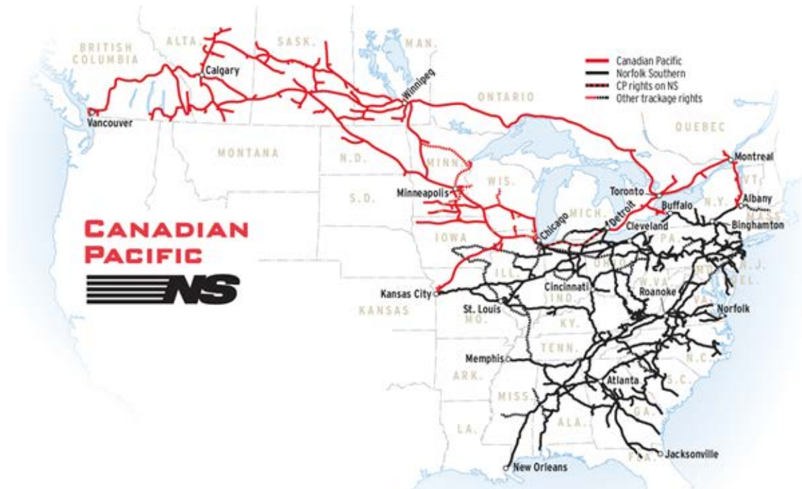
Figure 2. The CP and NS railroad systems.

As is well demonstrated in the literature examining the impact of the ownership of an equity interest in one firm by a firm with which it competes, if and when Company A and Company B are competing for the same business, the shareholders to whom Company B managers report will not want Company B to behave too aggressively vis-à-vis Company A, because Company A's losses are their losses too.