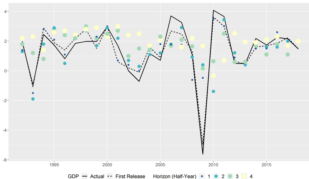
Figure 1: GDP growth and GDP forecasts by the OECD

Note: Growth rate and forecasts in percentages. Forecast errors for a longer horizon are depicted by larger points and lighter colours.