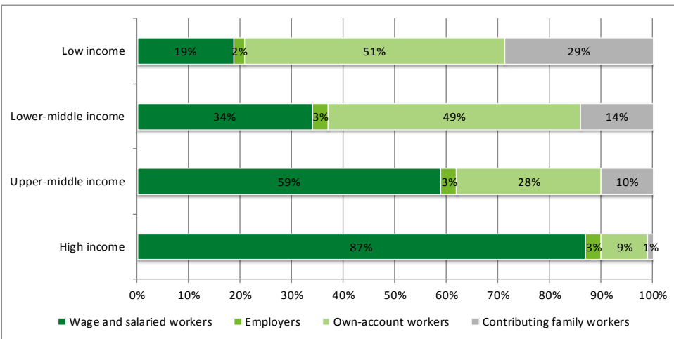
Figure 2: Share of employment status among working population by country income group.