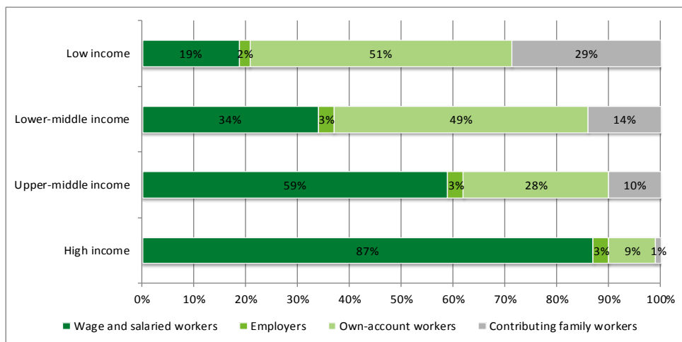
Figure 2: Share of employment status among working population by country income group.

(Source: ILO modelled estimates, November 2018)