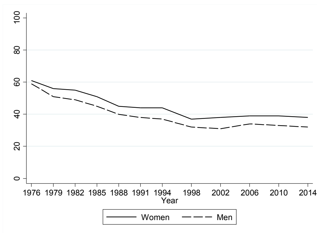
Figure 2 Eligible foreign citizen voter turnout in municipal elections, 1976–2014

Despite the importance of these elections, the turnout of noncitizens has decreased over time. Figure 2 shows that about 60 percent of eligible noncitizens voted in the 1976 municipal elections, while the corresponding figure in 2014 was only about 35 percent. Throughout the period turnout is slightly higher among women than among men.