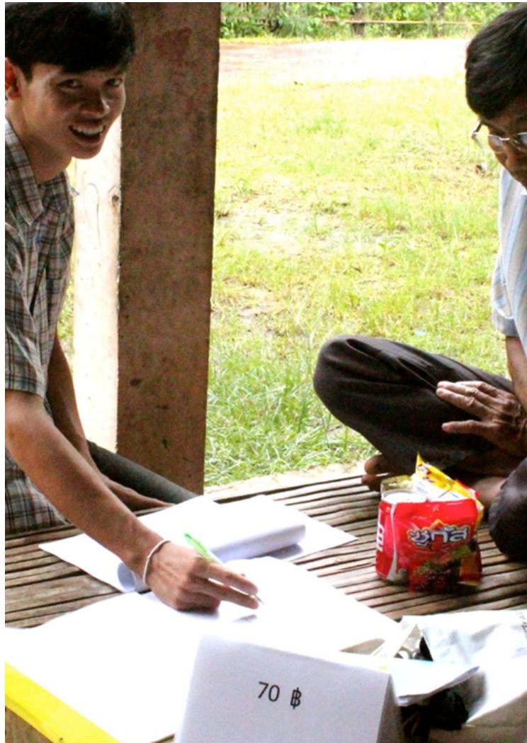
Figure A.1: Control