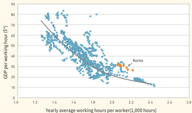
[Figure 1] Working Hours and Labor Productivity in OECD Countries: 1990-2016