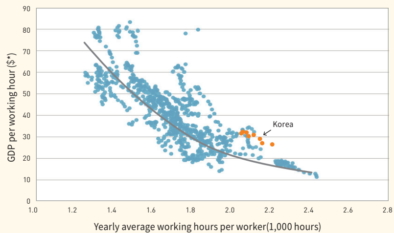
[Figure 1] Working Hours and Labor Productivity in OECD Countries: 1990-2016