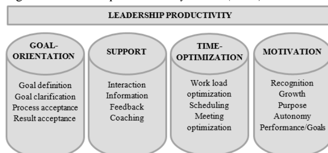
Figure 1: Leadership Productivity Model (LPM)

To make qualified management decisions it is not only necessary to have a correct and validated model, it is also necessary to measure the elements of a model cor-