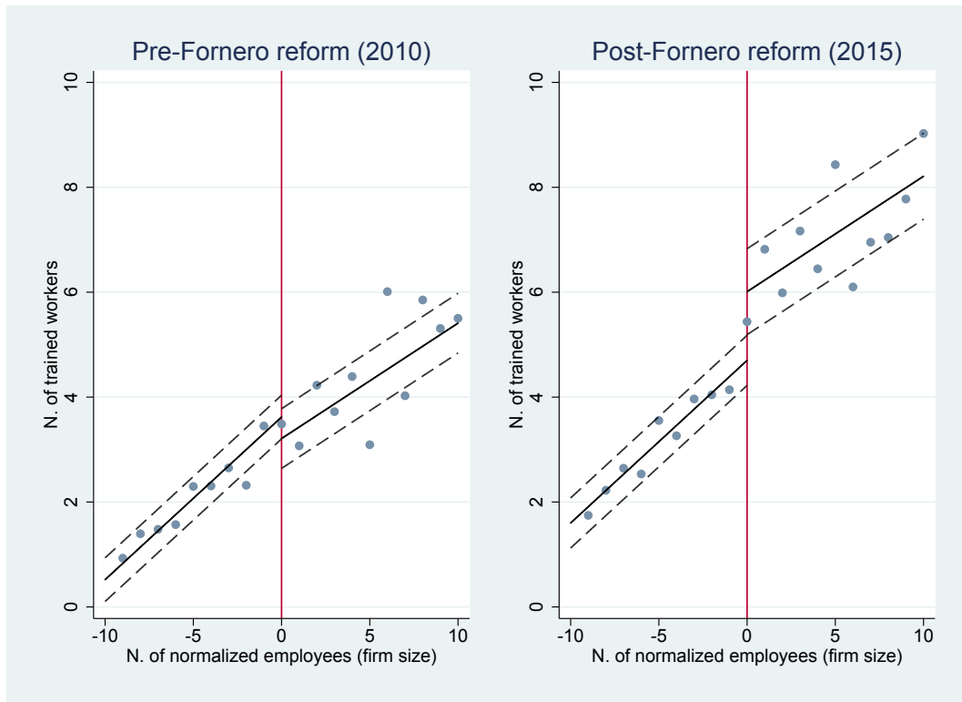
Figure 2: Firm size and observed training provision before and after the Fornero reform

Note. The Figure reports a scatter plot for the average number of employed workers by one employee-bins of firm size (computed using survey weights) before and after the Fornero reform and the fitted (solid) line of a regression of the number of trained workers on normalized employment (see column (1) of Table 3). Normalized employment is reported on the horizontal axis so as ‘0’ corresponds to the cut-off (i.e. firm’s employment level equal to 15). The scatter plot is reported for the bandwidth 6–25 employees of firm size (i.e. normalized size between –10 and 10). Dashed lines are 95% confidence intervals.