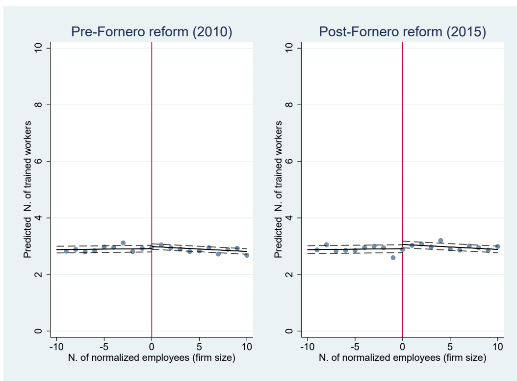
Figure 3: Firm size and predicted training provision before and after the Fornero reform

Note. The Figure reports a scatter plot for the average number of employed workers by one employee-bins of firm size (computed using survey weights) before and after the Fornero reform based on the predicted values of a regression of observed training provision on region and industry dummies, and the fitted (solid) line of a regression of the predicted number of trained workers on normalized employment. Normalized employment is reported on the horizontal axis so as '0' corresponds to the cut-off (i.e. firm's employment level equal to 15). The scatter plot is reported for the bandwidth 6–25 employees of firm size (i.e. normalized size between –10 and 10). Dashed lines are 95% confidence intervals.