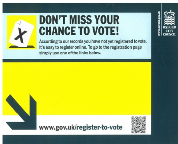
Figure 1: Postcard used in the Baseline treatment

All postcards were double sided (see Figure 1 for a copy of the postcard used in our baseline condition and Appendix B for copies of the other postcards). The back simply contained the message, 'IMPORTANT INFORMATION ABOUT YOUR RIGHT TO VOTE, OVERLEAF.' The front featured the heading, 'DON'T MISS YOUR CHANCE TO VOTE! According to our records you have not yet registered to vote. It's easy to register online. To go to the registration page simply use one of the links below.' The bottom of this side contained the address of the government web page for registering to vote, and a QR code which would take recipients to the same page. These features were held constant across treatments. The postcards differed by treatment only according to the text included in a box below the heading on the front side.