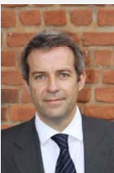
Dr. Stephan Klingebiel

Finally, RBA approaches assume a clear performance orientation in the partner countries. This might apply to the reform dynamic countries (good performers), but countries without good governance may be less susceptible to such systems of incentives, and thus other approaches might be more suitable in cases like this.