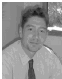
Prof. Dr. Aurel Croissant Institute for Political Science, University of Heidelberg

In the light of these findings, what is needed is a highly realistic assessment of the effect of development cooperation on governance structures in the region. Not only is the persistently generous flow of resources to autocratic regimes hardly to be seen as an incentive for establishing democracy and improving the rule of law: the governance objectives defined in development cooperation are likely to be only one aspect of the donors' package of foreign policy interests. At best, then, good project and programme work can be expected in less conspicuous governance sectors – as in the strengthening of local government, the promotion of transparency in administrative procedures and "good" fiscal governance. In the short to medium terms at least, it is, however, unrealistic to hope that development policy will make a more structural contribution to the establishment or consolidation of democracy and the rule of law in the region.