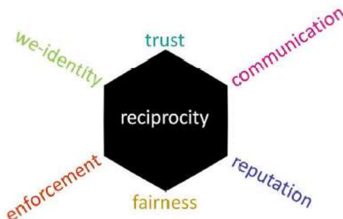
Figure 1: Cooperation Hexagon

Messner et al. (2013) argue that there has been a remarkable convergence across different disciplines about the basic enablers of cooperation. Reciprocity, trust, communication, reputation, fairness, enforcement and we-identity can be used to explain what makes cooperation work. The ordering is rather subjective, but it is important to note that reciprocity is at the centre of the diagram because it is a fundamental precondition for long-term cooperation.