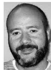
Sergio Puente Bank of Spain.

The remainder of this article provides a non-technical summary of Galán and Puente (2015), who estimated the effects of an important minimum wage increase that occurred in Spain in the late 2000s. These estimations are then used to provide an assessment of recent and projected increases, both in terms of efficiency and equity. The bottom line is: minimum wage increases actually could do harm on both fronts.