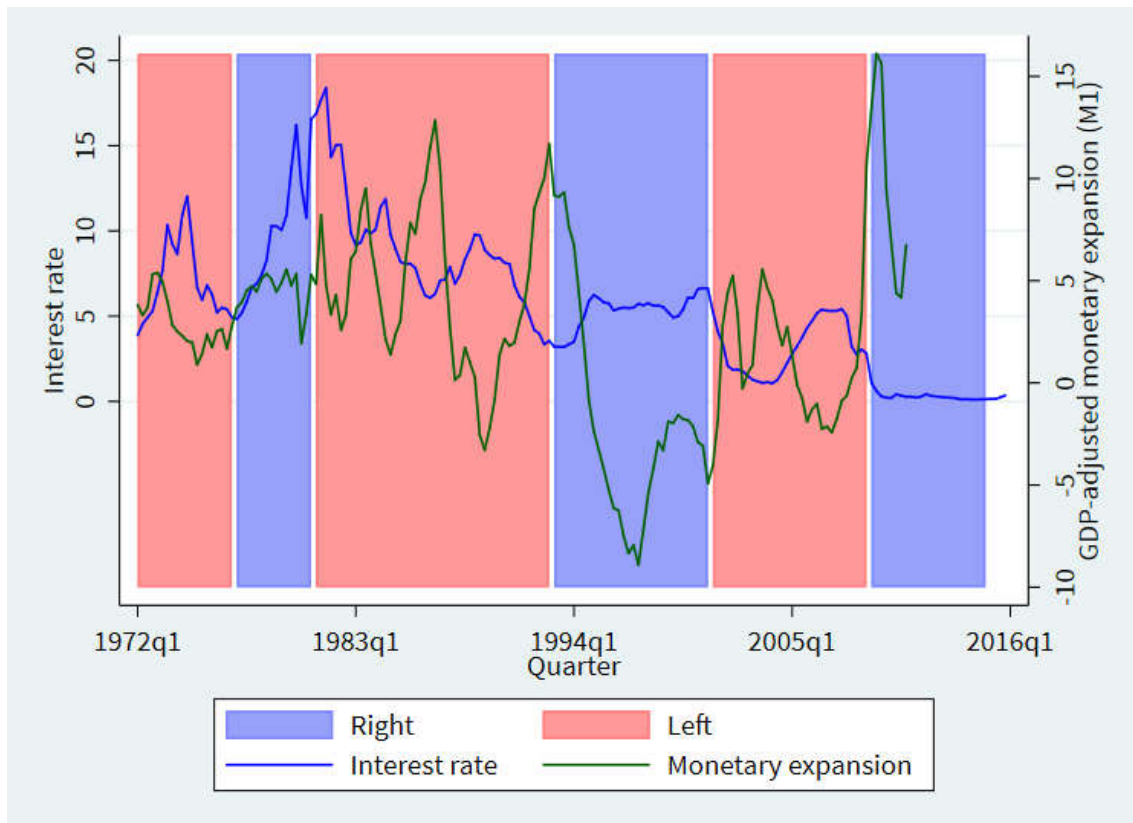
Figure 4: United States

Notes: The mean interest rate under leftwing governments in the United States (1972-2010) was 5.88% (56 observations) compared to 6.71% (100 observations) under rightwing governments (p-value 0.51). The mean GDP-adjusted monetary expansion under leftwing governments in the United States was 1.64% (56 observations) compared to 3.20% (100 observations) under rightwing governments (p-value 0.95).