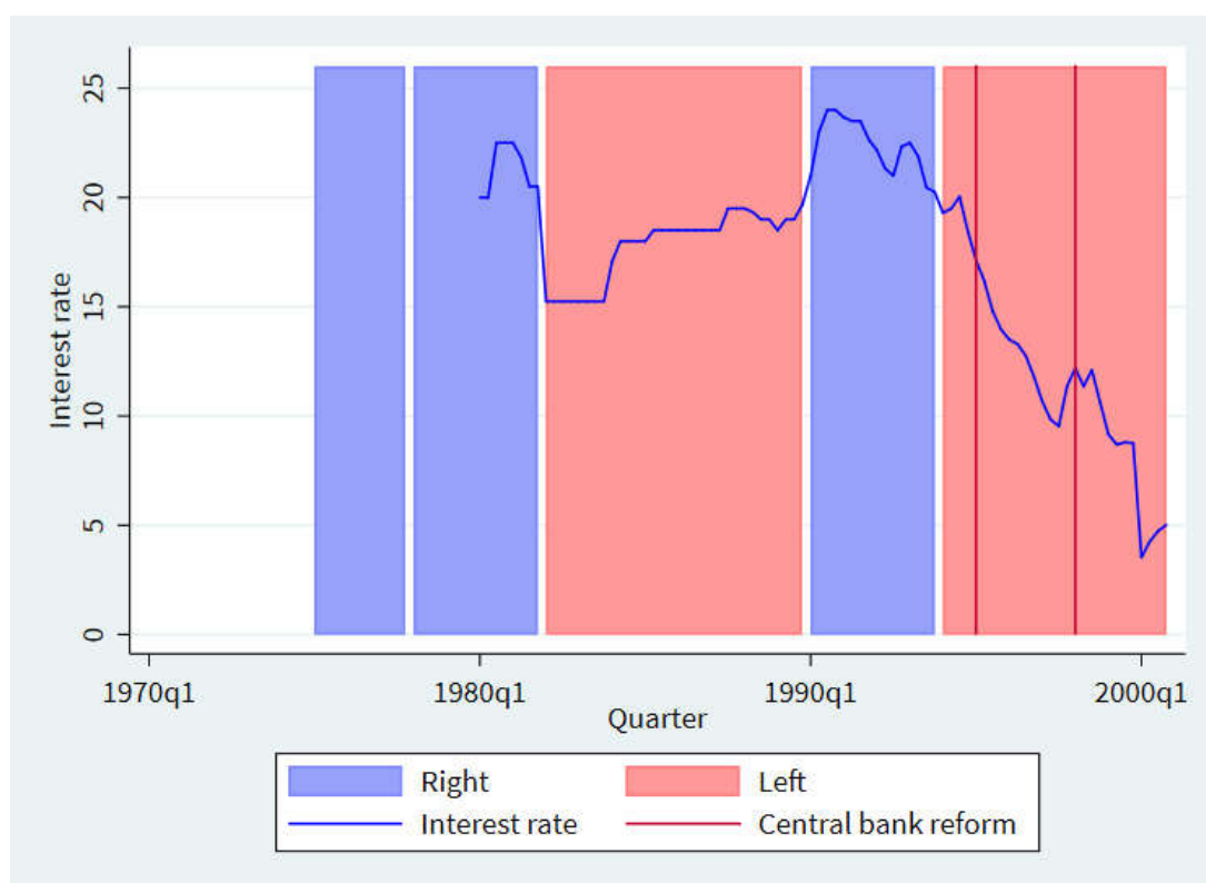
Figure 1: Greece

Notes: The mean interest rate under leftwing governments in Greece (1980-2000) was 15.02% (60 observations) compared to 22.07% (23 observations) under rightwing governments (p-value 0.00).