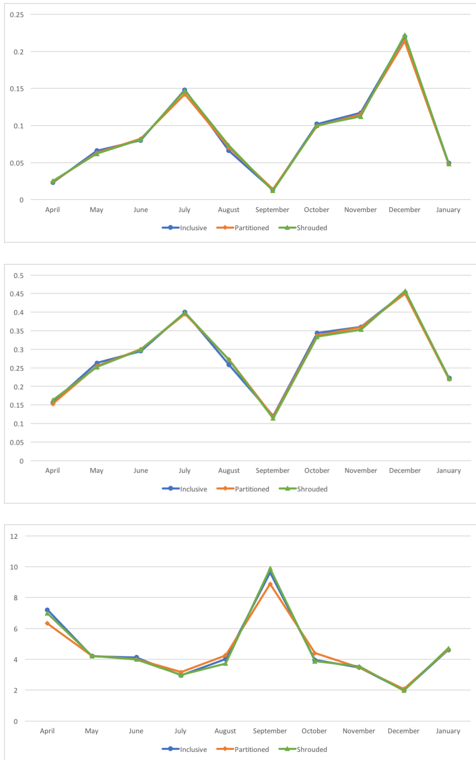
Figure D.1. Empirical moments of the number of purchases for 3D movies.

Notes to Figure D.1: The figure in the upper panel depicts the average number of purchases for 3D movies in each month for each treatment separately. The figure in the middle panel depicts the variance in the number of purchases for 3D movies in each month for each treatment separately. The figure in the lower panel depicts the skewness of the number of purchases for 3D movies in each month for each treatment separately.