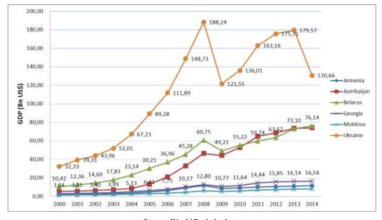
Figure 1 – GDP Growth Dynamics (Bn. US$)

In Ukraine, there are periods of sharp economic downturn during the world economic crisis and the current conflict in Ukraine.