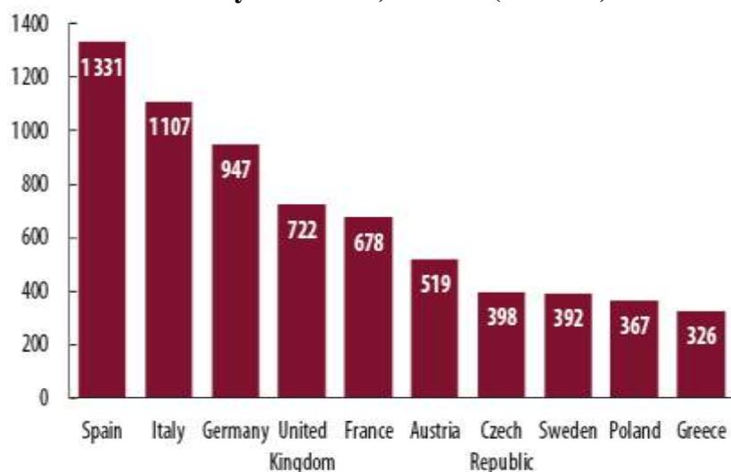
Figure 1 - The 10 EU Member States with the most organic agricultural land (in conversion and fully converted) in 2009 (1 000 ha)