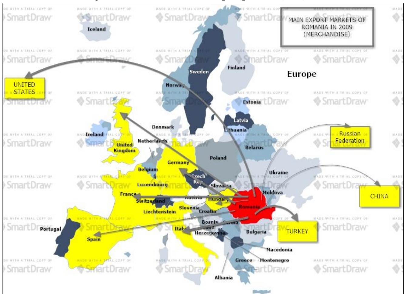
Figure 4 – Romania's main 10 export partners (2009)