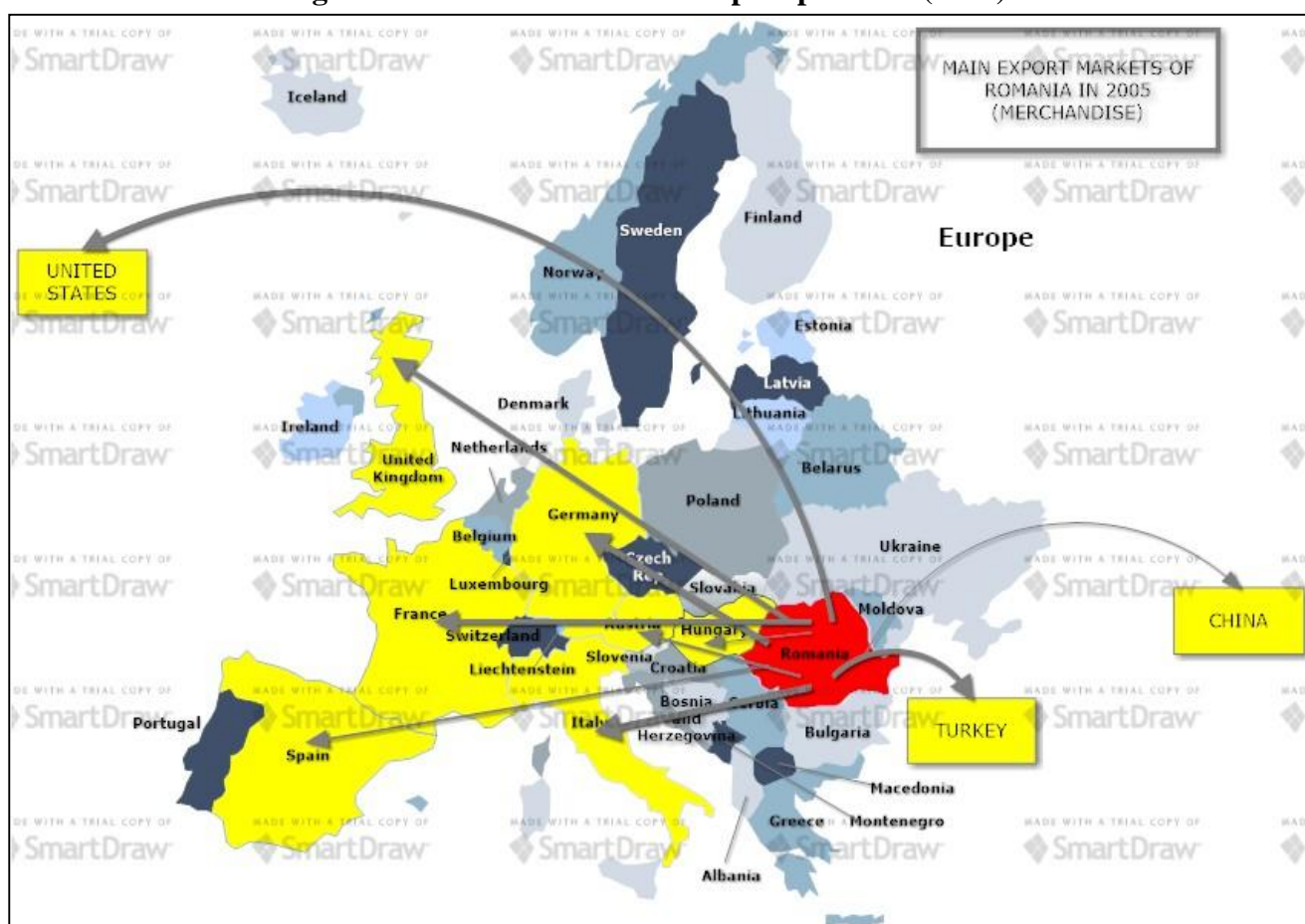
Figure 3 – Romania's main 10 export partners (2005)