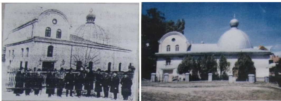
Figure 4 - Big Synagogue between 1939 and 1980

There are many opinions regarding the building of Synagogue. Thus, it is said the land on which is built the Big Synagogue was bought in 1657, afterwards the rabbi Natan Nata Hanover insisted that this synagogue to be completed in 1670-1671. Another story tells us that she was built between 1657 and 1682 and the land which was built on belonged to Aron-Voda monastery 5 .