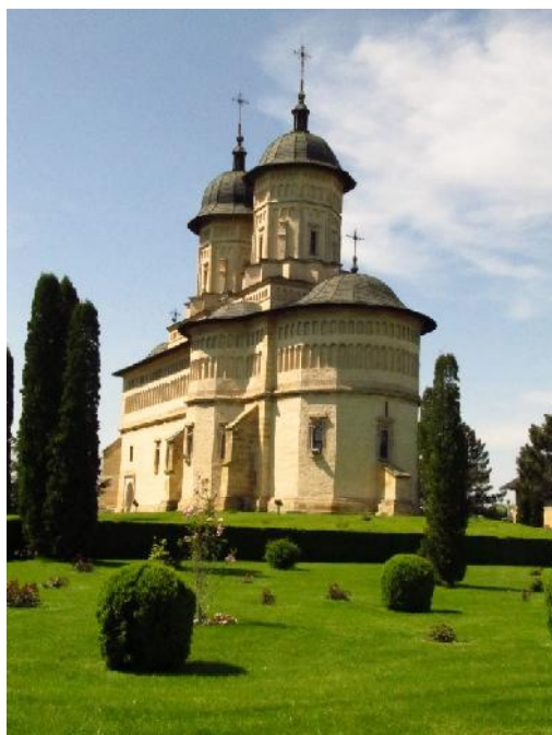
Figure 1 - Cetatuia monastery, April, 2014