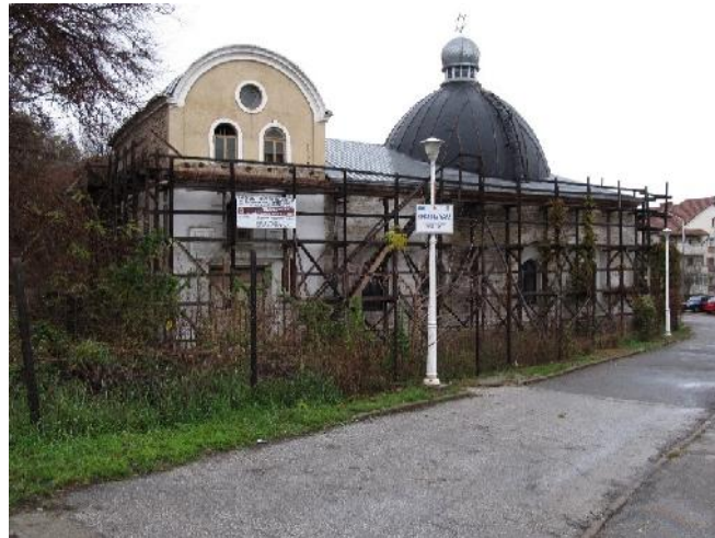
Figure 5 - Big Synagogue, November 2013