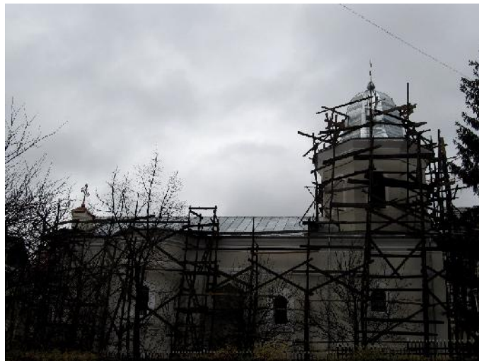
Figure 6 - Saint Pantelimon church, November 2012