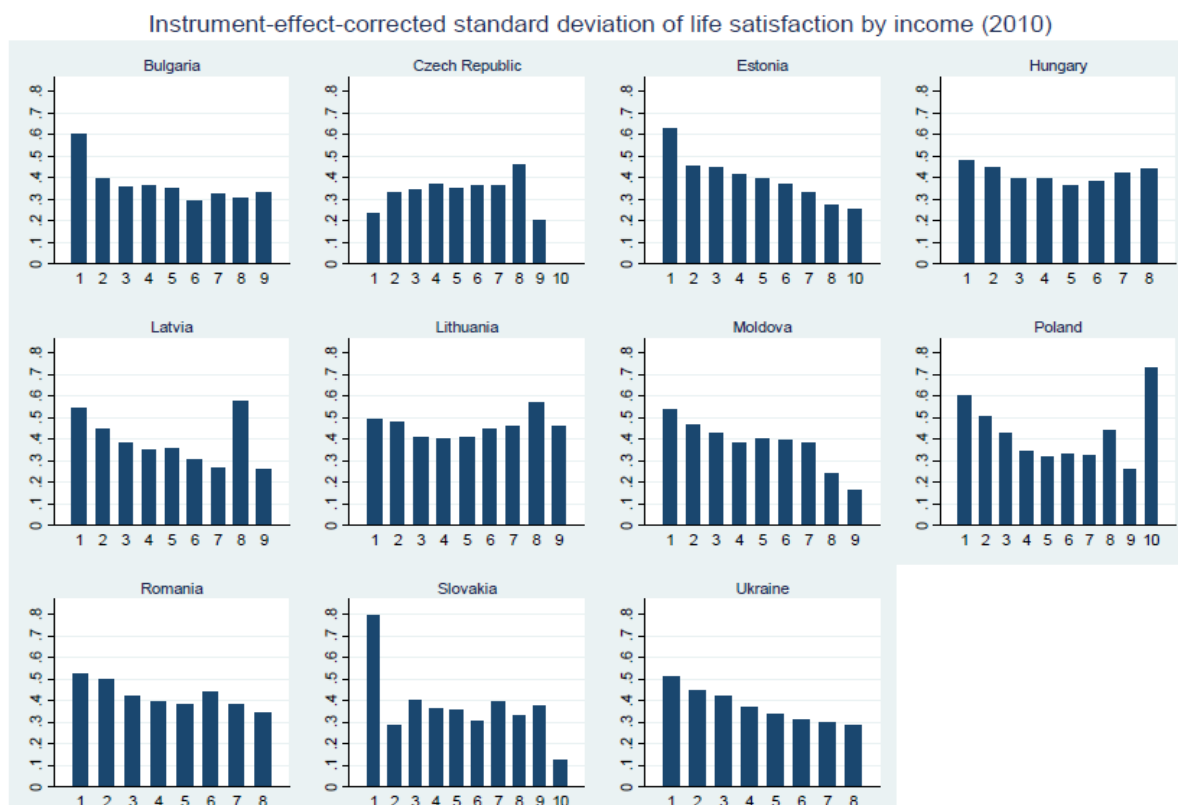
Figure 2 - Life satisfaction inequality by income (2010)

Source: own computation. Data from Life in Transition Survey, 2010.