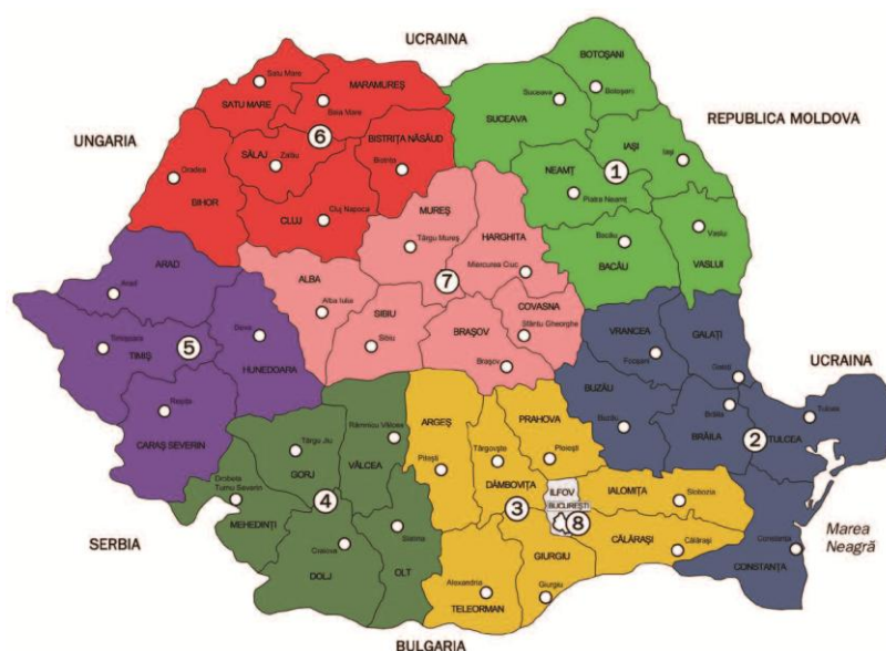
Figure 2 - Map of the regional division in Romania