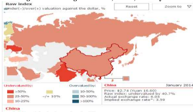
Figure 2 – The Big Mac Index, China, January 2014