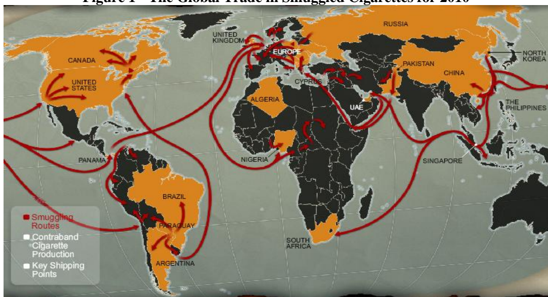
Figure 1 - The Global Trade in Smuggled Cigarettes for 2010