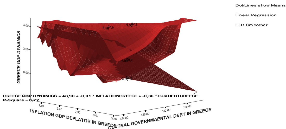
Figure 3 – Regression Model: Greece