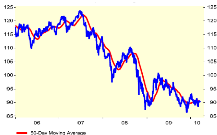
Chart 3 - USD/JPY evolution during January 2006-January 2010

In January 2006, the exchange rate EUR / USD was at her lowest level, below 1.2, then increased gradually exceeding 1.6 in May of 2006, then fall to 1.3 USD / EUR in January 2009 and reached in 2010 a level of approx. 1.35.