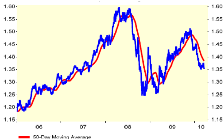
Chart 2 - EUR / USD evolution between January 2006-January 2010