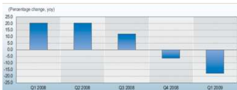
Chart 1 - World exports of commercial services Q1 2008 - Q1 2009