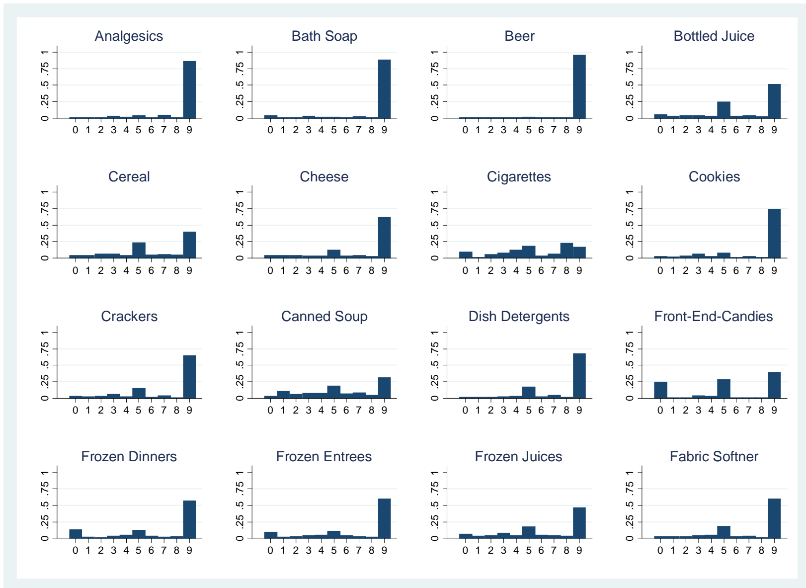
Figure 2. Frequency Distribution of the Last Digit of the Retail Prices at Dominick's, by Product Category, September 14, 1989–May 8, 1997