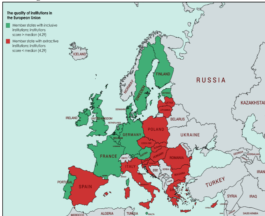
Figure 1. The main institutional cluster of EU member states