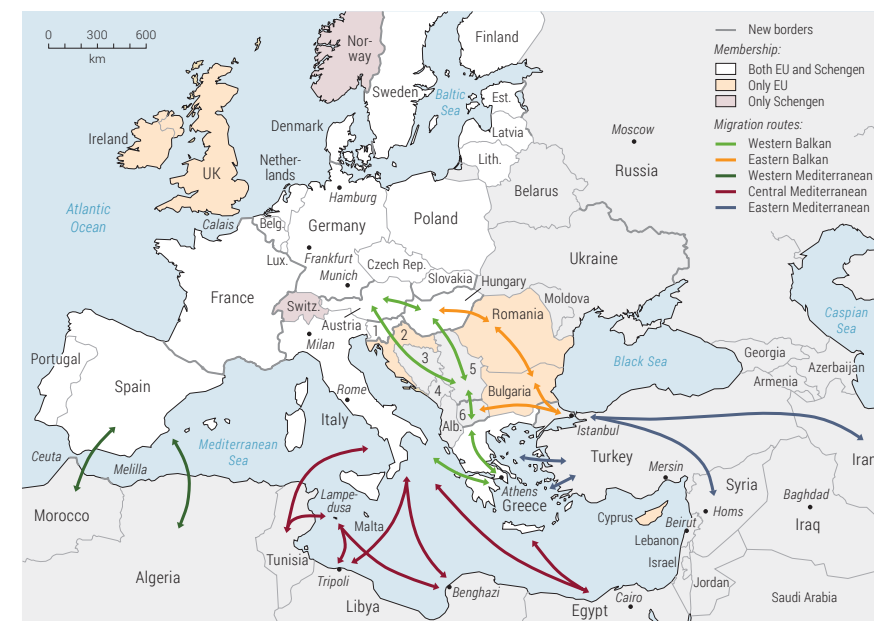
Note: 1) Slovenia - 2) Croatia - 3) Bosnia Herzegovina - 4) Montenegro - 5) Serbia - 6) Macedonia.

The great majority of migrants and refugees arriving in Greece in this period continued northwards along the so-called Balkan routes. These routes were consolidated throughout the summer of 2015 and took off at the end of August, when Germany suspended the Dublin Convention for Syrians. The routes from Greece primarily went through the Balkan countries of Macedonia, Serbia, Hungary or Croatia and then onwards to Western Europe. In the first months, the overall response of these Balkan countries was to let people pass through, but this approach changed with the closing of the borders from the autumn of 2015, first with the completion of a fence between Hungary and Serbia in the middle of September, followed by new fences established between Hungary and Croatia. 36 In the middle of November, Slovenia, followed by Croatia, Serbia and Macedonia, closed their national borders to all nationalities other than Syrians, Afghans and Iraqis, 37 who were allowed to pass through.