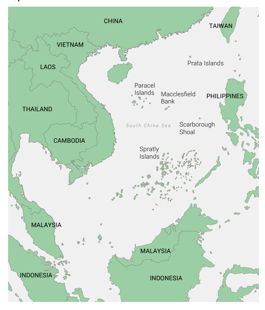
Note 1: The disputed archipelagos in the South China Sea have been enlarged to make them more visible. Note 2: All the disputed land features in the South China Sea are denoted by their English names.

The South China Sea (SCS) connects the West Pacific with the Indian Ocean and is a partially enclosed sea bordered by Vietnam to the west, Malaysia, Singapore and Indonesia to the south, the Philippines and Brunei to the east and China as well as Taiwan to the north (see map 1). The geopolitical significance of the SCS stems not only from its lucrative fisheries and the vast gas and oil reserves that are believed to lie beneath its seabed, but also from the fact that around 1/3 of the world's shipbased trade passes through its waters, including up to 80% of China's oil imports