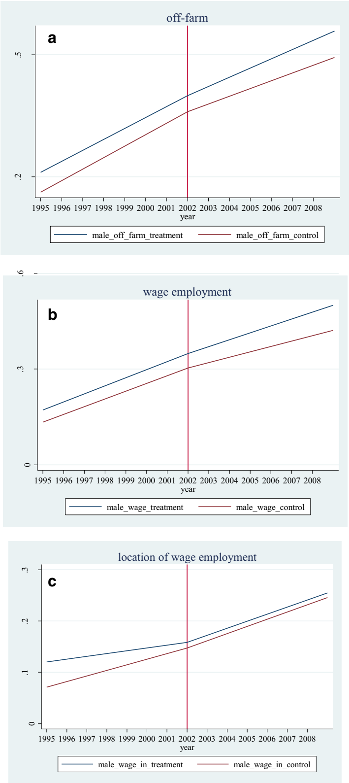
Fig. 2 Evolution in time of employment outcomes. Men. Source: The following data sources, if not specifically stated, are from CHIP