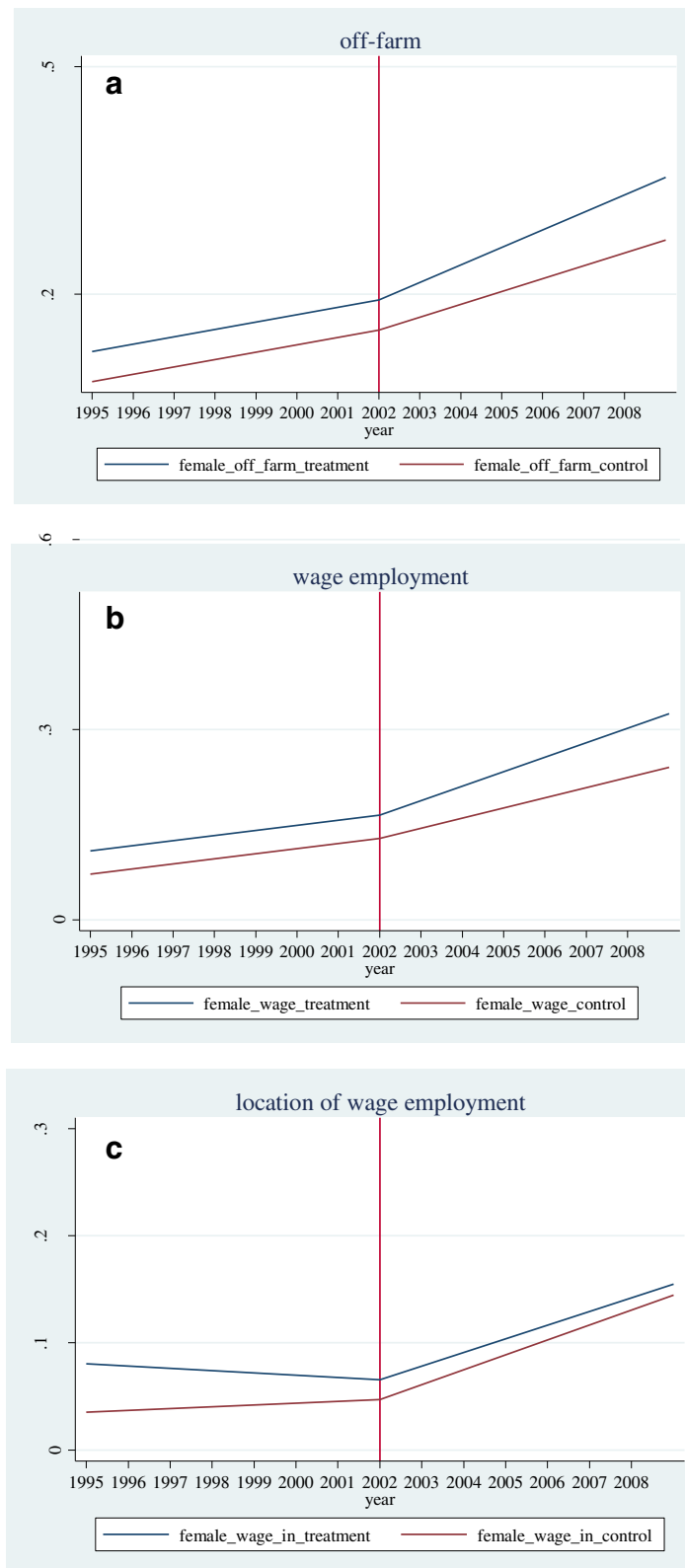
Fig. 1 Evolution in time of employment outcomes. Women. Source: The following data sources, if not specifically stated, are from CHIP