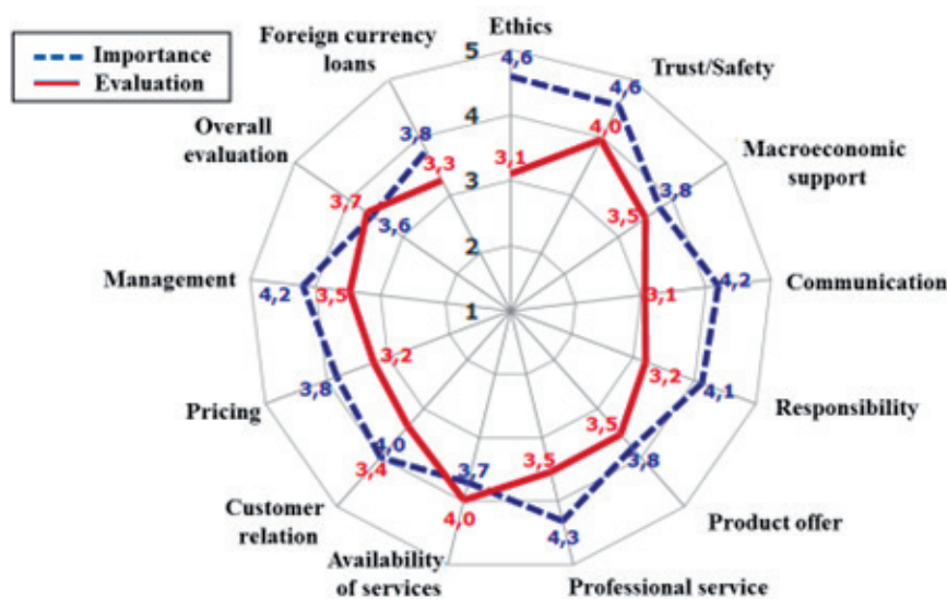
Figure 3: Importance and evaluation of particular aspects of banks' activities - 2015 (range 1 - 5)

1) The average level of banking penetration ratio significantly increased during the era of transition. The biggest acceleration was recorded at the end of the period of good economic and banking growth, whereas since 2009 stagnation (with minimum upward trend) has been persisting in this field. It seems thus that banks' challenge in the years to come will be attracting customers from competition or through growing sale of products