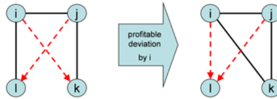
FIGURE 2. Coordination Incentives.

(ex post) strength, where agents in stronger cliques extract payoffs from agents in weaker cliques. 16