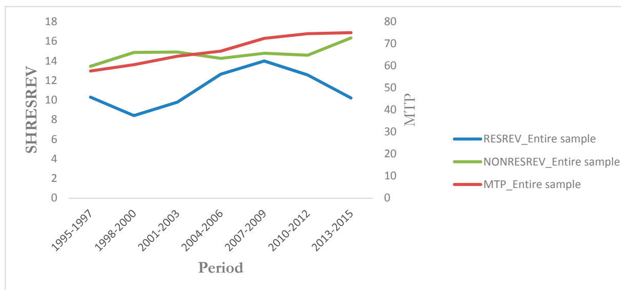
Figure 1. Evolution of “RESREV”, “NONRESREV” and “MTP”_Over the Entire sample.

It could be observed from Figure 1 that multilateral trade liberalization has exhibited an upward trend over the period, thereby suggesting that over time, the world has witnessed greater trade liberalization, albeit steadily. In the meantime, after a decline from 10.3% in 1995–1997 to 8.4% in 1998–2000, resource revenue has steadily increased up to 14% in 2007–2009. It has then shown a declining trend to reach 10.2% in 2013–2015. Non-resource revenue has always moved in the opposite direction to resource revenue. It has remained relatively stable around 14.2% to 14.9%, from 1995–1997 to 2010–2012, and has increased from 14.6% in 2010–2012 to 16.3% in 2013–2015.