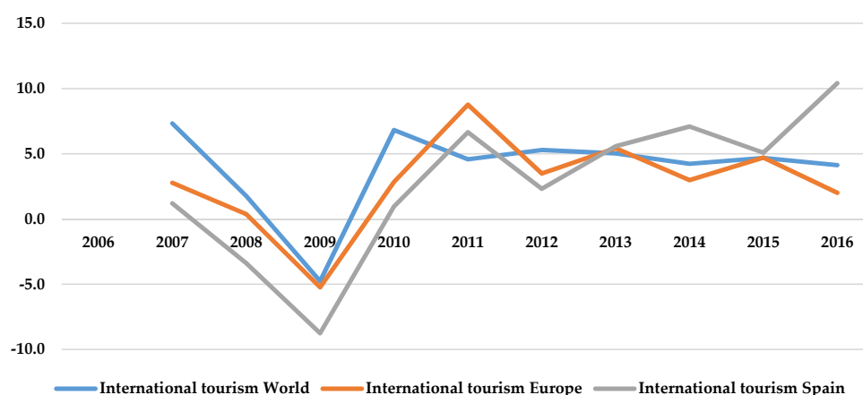
Figure 1. Percentage evolution of the international arrivals among the World, Europe and Spain (2006–2016) according to “UNWTO Tourism Highlight Series” data (UNWTO 2000–2016).

A comparison of these results with those registered by the UNWTO in relation to the arrival of international and European tourists, found in the series UNWTO Tourism Highlight , provides a number of valuable insights. Already in 2008, the UNWTO witnessed a drop of -3.8\% in the number of international tourist arrivals, while in Europe and the rest of the world the decline in visitor numbers was not noted until 2009. In addition, in Spain, two consecutive years of losses were noted, compared to just a single year for Europe and the rest of the world. Thus, one could argue that the decline in international tourism manifested itself first in Spain, and lasted much longer there than in other parts of the world. In contrast, Spain has been experiencing a higher percentage increase in international tourist arrivals, compared to that of Europe and the rest of the world. The year 2016 is especially significant, showing an increase of nearly 10\% , when compared to 4.1\% and 2\% in the rest of the world and Europe respectively (Figure 1).