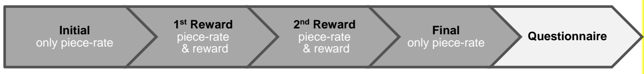
Figure 1. Flowchart of the experimental phases

Eleven subjects participated in each experimental session; ten took the role of employees and one took on the role of the employer . In the experiment, they were respectively named role A and role P . Employees had to perform a real effort task along the lines of that in Gill and Prowse (2012), which consisted of correctly placing as many sliders as possible 9 on a pre-assigned number (see Figure 9 in the Appendix) within a five-minute period. Employees who correctly placed sliders were paid 10 Experimental Currency Units (ECU 200=€1) per piece. These ECUs accumulated in each individual's personal account. The employer observed the employees' performance and collected a percentage of each employee's payment—1 ECU for each correctly placed slider. Each employer gained 1/10 th of the gains for each of her 10 employees, or in other words, the average gains in the piece-rate task of the ten employees.