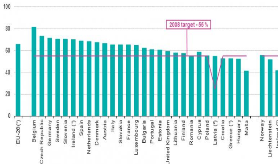
Figure no. 3: Recycling rate for all packaging, 2014

A large proportion of the EEA countries have captured the 55% waste recycling rate as shown in figure no. 3. Croatia, Greece, Hungary and Malta could not catch the specified rate. Those countries that could not catch the 55% limit except Malta are very close to this 55% limit.