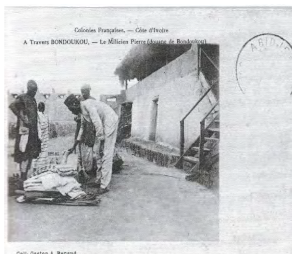
Déjà la douane.

The first moment of African integration spans the colonial period, and started at the Berlin Africa Conference (1884), in the recently integrated German empire. The scramble for Africa that ensued destroyed local empire-building enterprises and replaced them with new ensembles based on the new needs of an industrializing Europe. It consists of a dual movement of division and integration: each colonial power took over a chunk of Africa, instituting mercantilist boundaries that separated it from its neighbours, but merging its different communities into a large administrative and commercial block. The defining feature of these blocks were customs borders, and the rivalry between colonial powers (even though they may sometimes struck temporary deals of customs union such as the one between France and Belgium in the Congo River area in the early twentieth century) was defined by customs and tariffs. The French were obsessed about getting to a certain area before the “ douanes anglaises ” (English customs) and vice-versa. Populations should also be controlled in accordance with the imperatives of colonial trade and “ mise en valeur ” (improvement).