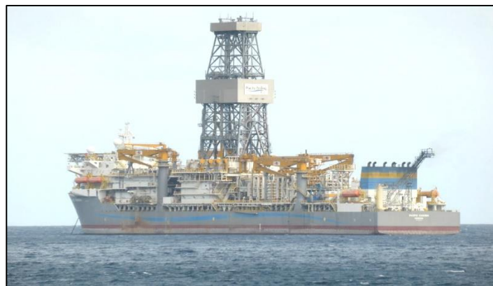
Figure 2. Illustration of a Modern Drillship: Pacific Khamsin

To appreciate the magnitude of what offshore operations entail, in terms of both capital and labor, Figure 2 shows a modern drillship—the “Pacific Khamsin.” It is 228 meters in length and 42 meters wide and was built in 2013 by Samsung in South Korea. It is designed with an ability to operate in a water depth of 12,000 feet (2.3 miles) and has a maximum drilling depth of 40,000 feet (7.6 miles) (Pacific Drilling, 2016a). The Pacific Khamsin can accommodate 200 workers (Pacific Drilling, 2016b). The cost of operating the ship per day is approximately $750,000 (Goodridge, 2015).