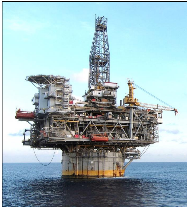
Figure 4. Example of a Platform Rig: The Mad Dog Spar in Deep Water in the Gulf of Mexico