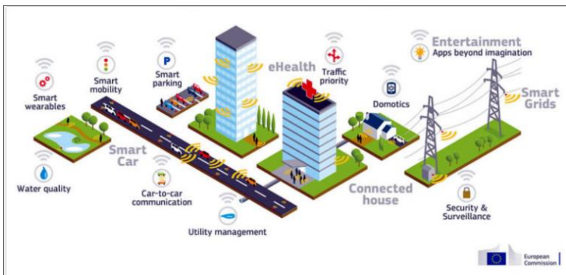
Figure 1. The framework for applying 5G technology to practice

Energy consumption and greenhouse gas emissions are two imminent world problems. Information and Communication Technologies (ICT) are responsible for a significant portion of global energy consumption. Power consumption by the grid (routers, fibre, and transmission) is about 12% of electricity consumption in countries with broadband access enabled. It is estimated that by 2020, it will increase to about 20% (Xia et al, 2010).