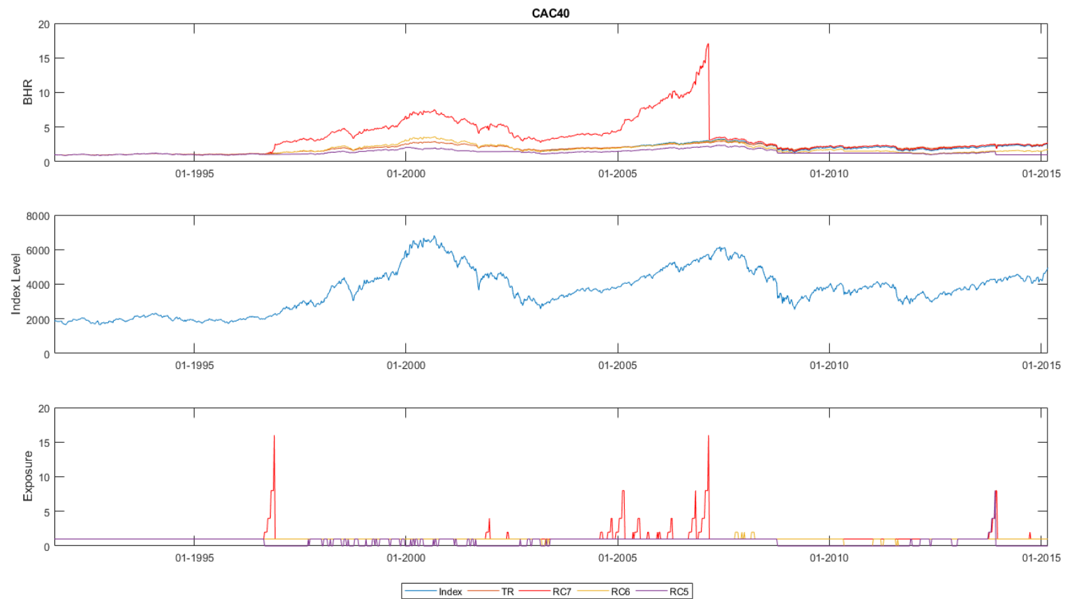
Figure 3. This figure displays the Buy and Hold returns (BHRs) of the volatility-based strategies, the index level and the exposures induced by the trading rule.