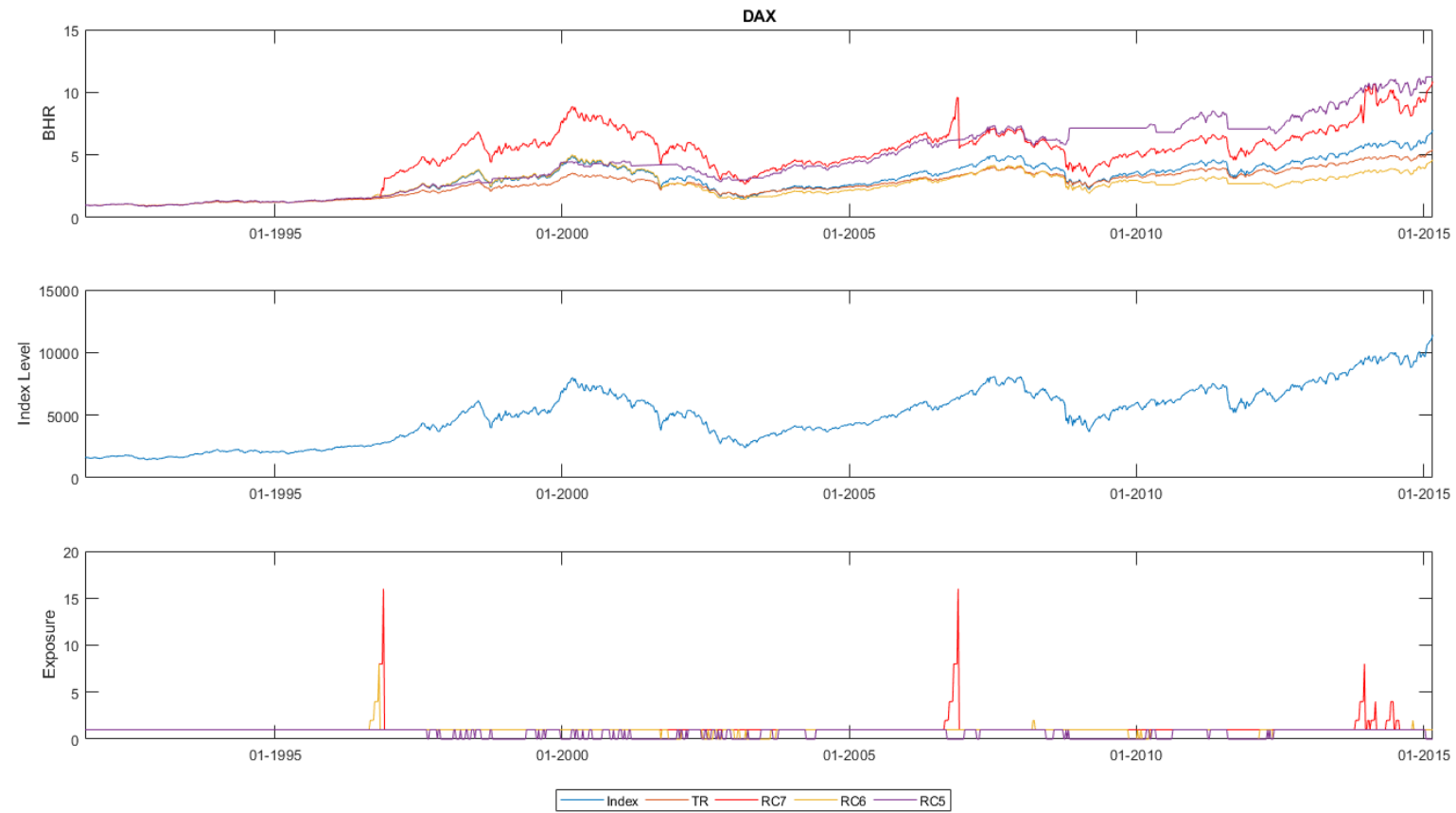
Figure 4. This figure displays the Buy and Hold returns (BHRs) of the volatility-based strategies, the index level and the exposures induced by the trading rule.