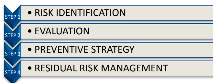
Figure 2. Evaluation steps.

The main phases and activities that each company follows in this sector can be summarized in four key points (Weymann 2015), as in Figure 2.