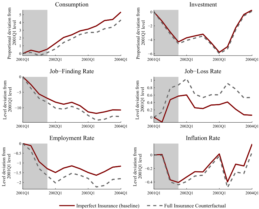
(b) 2001Q1 Recession