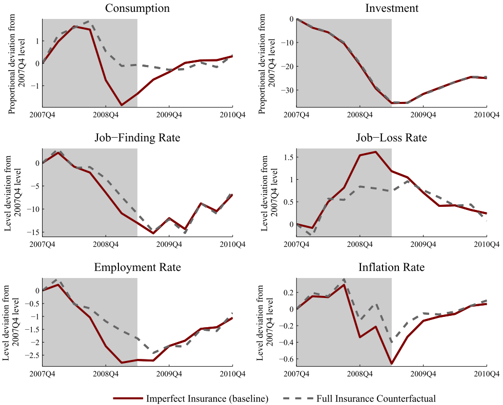
FIGURE 3. The Great Recession.

Note: The solid lines correspond to the actual paths of consumption, investment, the job-finding rate, the job-loss rate, and the employment rate. The dashed lines correspond to the counterfactual sample paths. Consumption and investment are reported in proportional deviation from their level at the beginning of the recession. All the other variables are expressed in level deviation from their values at the beginning of the recession. The grey areas indicates the recession dates.