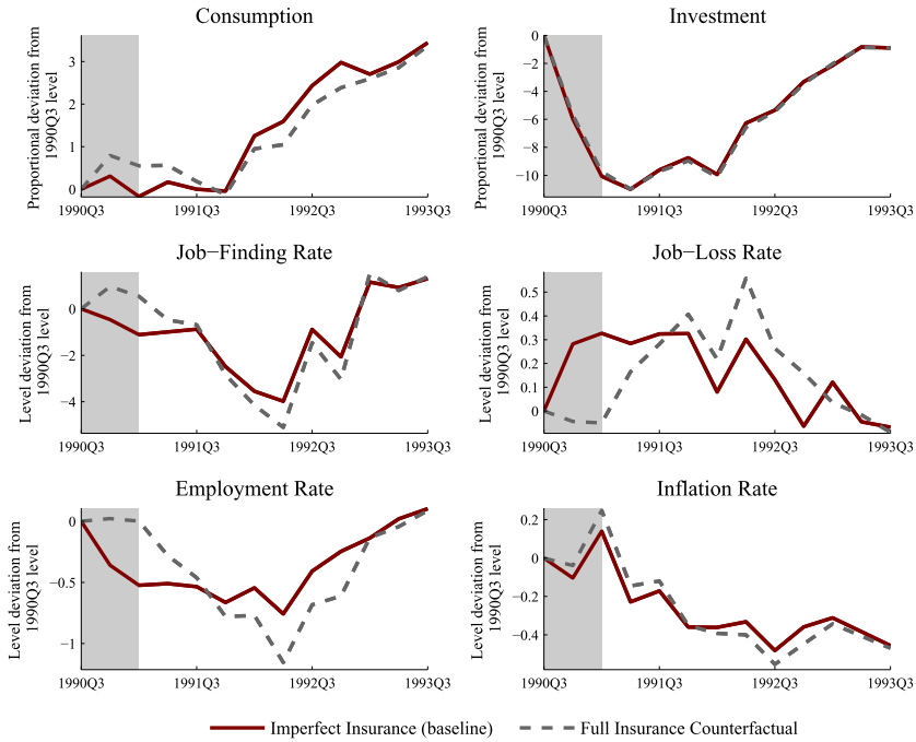
(a) 1990Q3 Recession