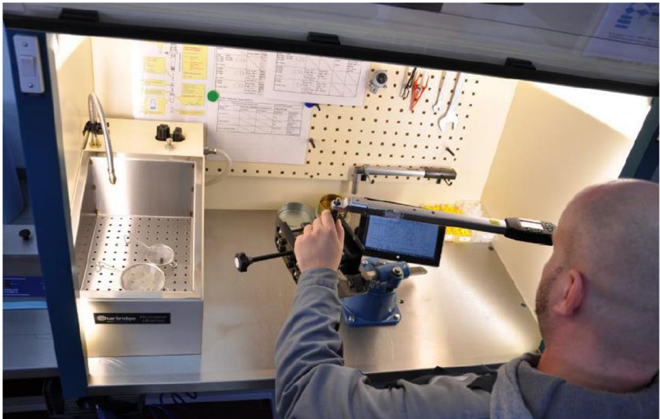
Fig. 2 Assembly of a remanufactured injector at a German automotive remanufacturing company using a clean cabinet, over pressure and filters capable of particle filtration down to 0,5 \mu\text{m}