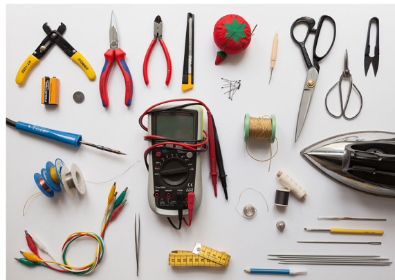
Fig. 1 Exemplary collection of tools used in e-textile making, the included tools that traditionally belong to the discipline of textiles or electronics, sometimes also to the jewelry and other related disciplines. In the center a multimeter with a pair of standard multimeter probes. A multimeter is essential to electronic measuring tasks, among others to measure resistances or detect short circuits

In a stereotypical electronic textile project, the fundamental tools include different needles and scissors for the textile manipulation, a multimeter for electronic measuring tasks, a soldering iron, wire strippers and pliers to handle electronic components and materials. They are a selection of instruments to meet individual goals, but not distinctly attributable to the domain of an electronic textile craft. These tools are adapted to fit the task, or a different way to reach a similar output is found. Borrowing tools from other disciplines can impose challenges to the work though: The tools have not been specifically designed for the task for which they are used; hence, they might not perfectly support the scenario they are applied in. Appropriating existing tools may in