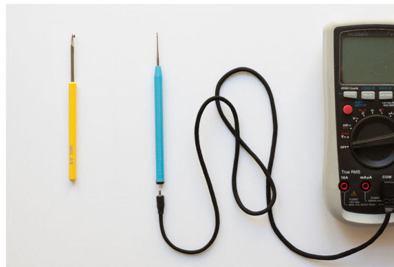
Fig. 3 A traditional crochet hook (hook size 3.5) with a yellow handle and a crochet hook multimeter probe (hook size 1.5) with a blue handle and custom-made multimeter cable. The blue crochet hook is connectable to the multimeter cable through a mini banana plug that goes into a mini banana jack at the end of the crochet hook. The multimeter cable on the other side connects to the multimeter

same quality tool when crocheting from a crafting perspective, but it allows crocheting a resistor, or resistive sensor, and simultaneously being informed about the resistance value of the crochet produced, from an electronic perspective. It is a deliberate choice to keep the visual appearance of the probe that of a traditional crochet hook to indicate what materials and creations this tool does address. Assumptions are that such an approach might also help making the electronic functionality as accessible as possible to people experienced in crochet but less experienced in electronics, as they can rely on the existing craft skills and tools they are mastering.