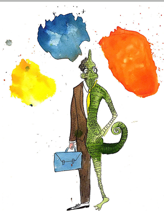
Fig. 2 The creative system changer, by artist Yara Said.