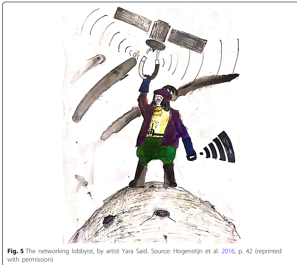
Fig. 5 The networking lobbyist, by artist Yara Said.

government officials. The stereotypes that were developed are therefore based on a limited range of experiences of social entrepreneurs that are active in Amsterdam New-West in the impact area of labour market participation. This small basis implies that research outcomes are not generalizable. We think that a large-scale survey or a randomised sample can yield better results; however, we are also aware that setting up such types of research with entrepreneurs can be a daunting task. We therefore do hope our results can still be a useful starting point for research in other contexts or impact areas.