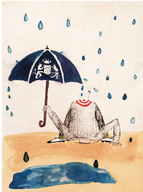
Fig. 1 The disappointed authority avoider, by artist Yara Said.